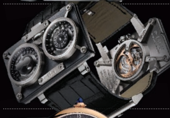
MB&F's 'HM2-CT1, Horological Machine #2' in black ceramic and titanium, $68,000, at Westtime, Los Angeles and Beverly Hills.