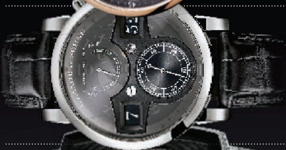
A. Lange & Söhne's limited-edition 'Zeitwerk Luminous' in platinum, $91,200, at Westtime, Beverly Hills.