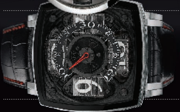
MCT's 'Sequential One' in white gold with black dial, $89,000, at Westtime, Los Angeles and Beverly Hills.