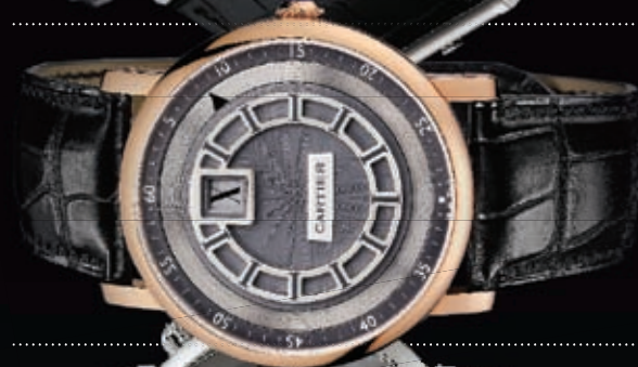
Cartier's 'Ronde de Cartier' jumping hours watch in 18-karat rose gold with engraved slate-colored dial, price upon request, at Cartier, Beverly Hills.