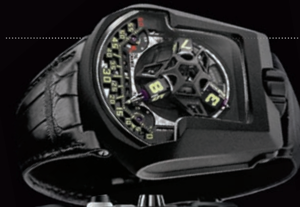
Urwerk's 'UR 203' with black platinum case, limited edition of 20 pieces, $220,000, at Westtime, Los Angeles and Beverly Hills.

1, 2, 3... Go reckon! Some of the coolest watches of the season are giving major face time to bold, graphic digits. On these clever pieces, it's the numbers, rather than traditional sweeping hands, that circle in dynamic, eye-catching fashion. For its Art Deco-inspired Ronde tique, Cartier tells the hour with distinguished Roman numerals that rotate into view. Want the immediate readability that can generally be found in an electronic digital display? A. Lange & Söhne, Christophe Claret and MCT present 7:52, 8:05 and 9:00 (as seen here) in such simple numeric form but with the elegance and mechanical ingenuity of top-tier watchmaking. And two imaginative mavericks, Urwerk and MB&F, have devised sci-fi time machines that have been described as kinetic sculptures—a fitting comparison as their stratospheric prices are worthy of a modern masterpiece. Who's número uno now? A